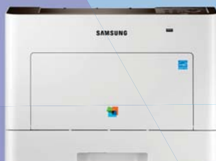
C3010ND (30 ppm)