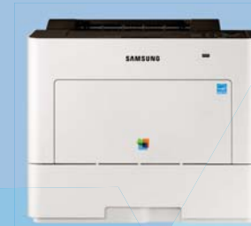
C4010ND (40 ppm)