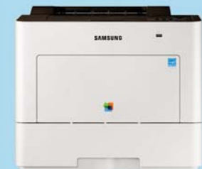
C4012ND* (40 ppm) *Only available in North America