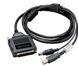
ML-PAR100 Parallel Connector