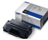
MLT-D203S Toner Cartridge 3K pages