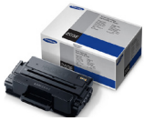
MLT-D203E Toner Cartridge 10K pages